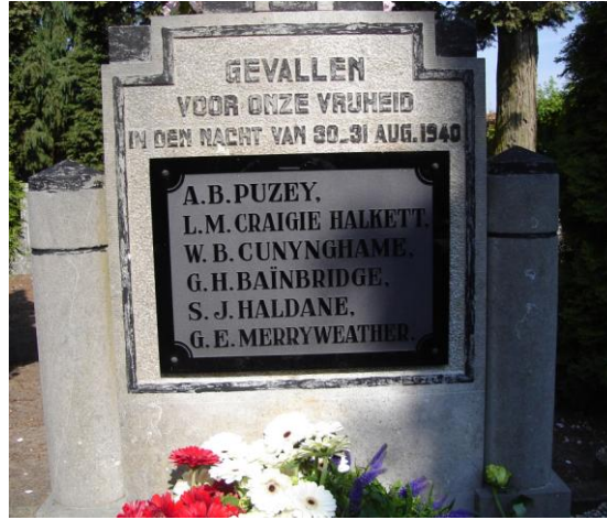
The memorial stone with the original text and the amended version.