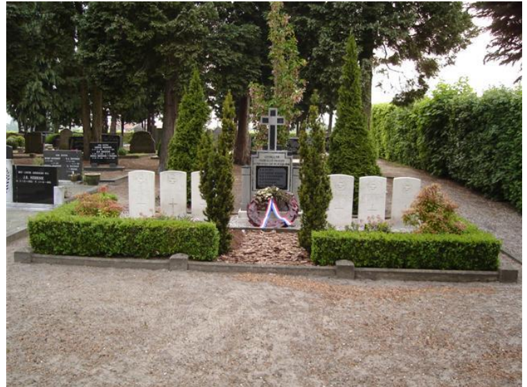
(ADJACENT PAGE) Photos of the current situation