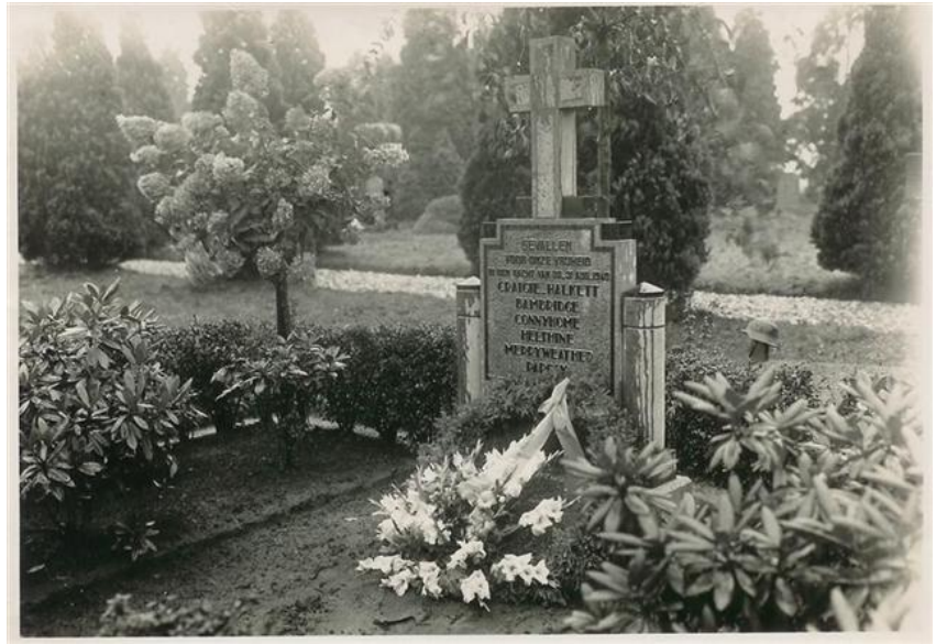
(LEFT) The memorial. Behind it, with a helmet on it, is a (temporary) German war grave.