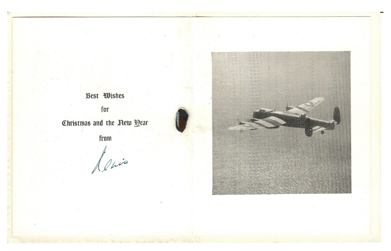
Number 214 Squadron Happy Christmas and New Year Card - Inside signed by my father