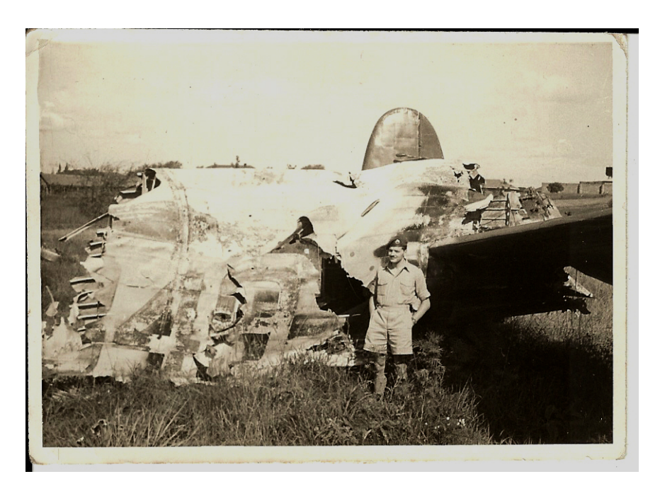
My father standing next to a crashed Lincoln tail section, believed to be RF349 of No. 49 Squadron RAF, which on 17 December 1953, stalled on take-off and landing gear collapsed at RAF Eastleigh