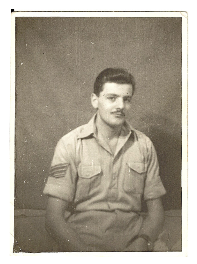
My Father - Number 214 Squadron at RAF Eastleigh, Kenya