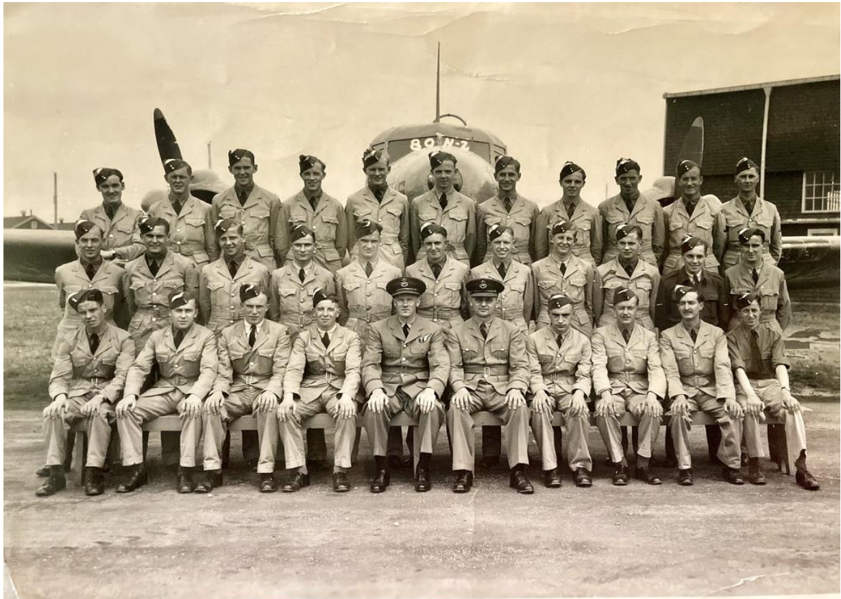
Portage-la-Prairie, Manitoba, 18/7/43, No 7, AOS (Air Observers School)