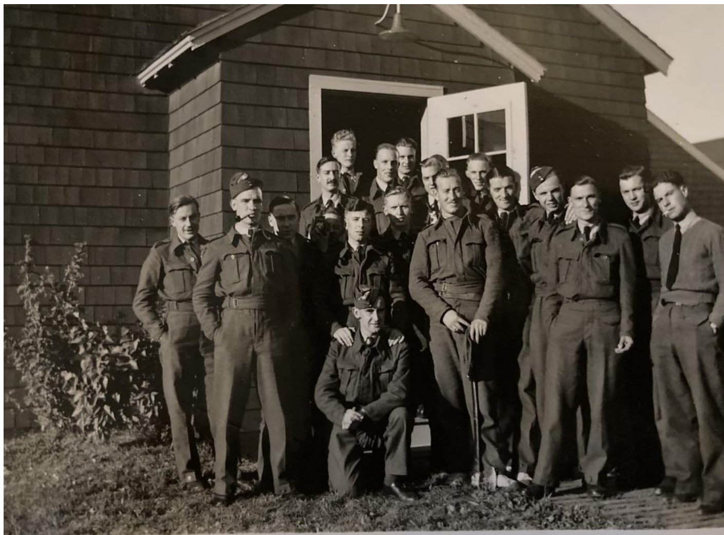
Unidentified men, location & date unknown (posted in case of interest to anyone )